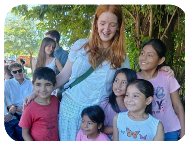
Loving the interaction