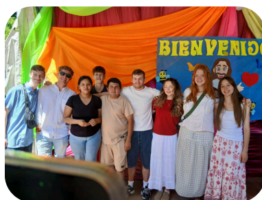
A special welcome